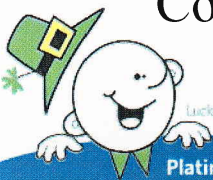
Lucky, St. Baldrick's mascot

Contact an organizer at (585)334-1472 or (585) 334-6533 for information